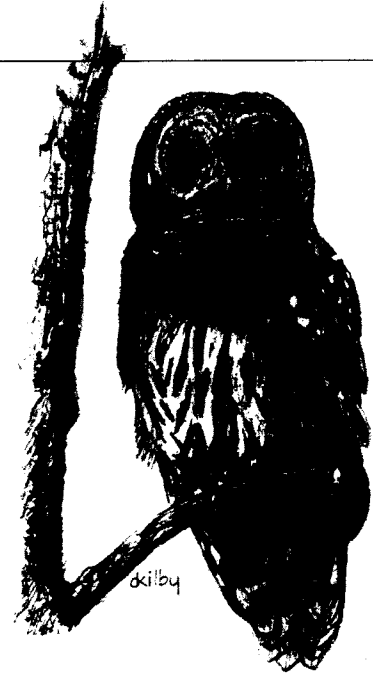
Barred Owl by Dan Kilby

In the book, each species is conveniently presented in a two-page spread containing a line drawing, descriptive account, data summary table, distribution map, and, in most instances, a table of breeding status by physiographic region and BBS (Breeding Bird Survey) map. Breeding codes—possible, probable, or confirmed—are assigned in accordance with recommendations of the North American Ornithology Atlas Committee. The illustrations consist of classic drawings