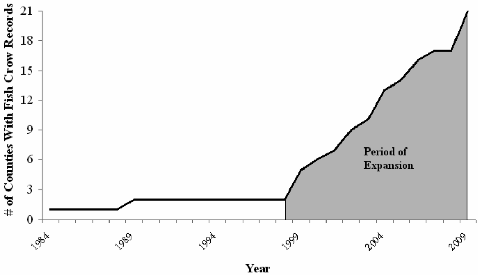
Fig. 3. A cumulative line graph of Kansas counties with Fish Crow records across a 25-year span (1984-2009) highlighting the period of expansion from 1999-2009.