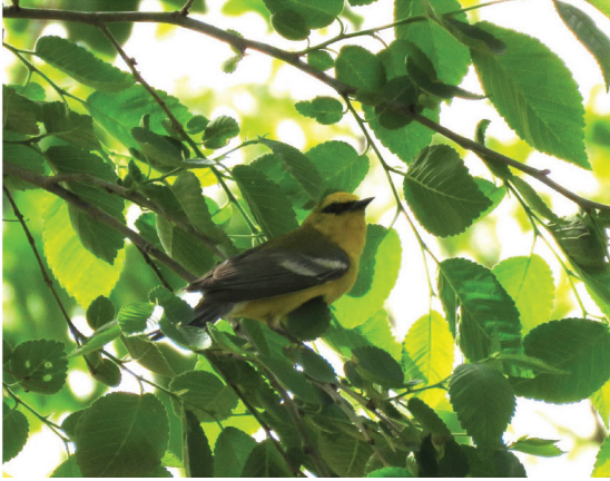
Figure 8. Blue-winged Warbler ( Vermivora cyanoptera ) observed at Hugoton in Stevens County, Kansas, on 7 May 2018.

Blue-winged Warbler ( Vermivora cyanoptera ), 2019-14, one adult male, 7 May 2018, storm water runoff ponds, Hugoton, Stevens County, reported by Kevin Groeneweg. Documented with photographs.