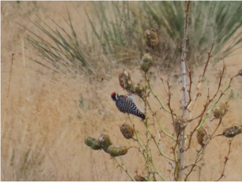
Figure 5. Ladder-backed Woodpecker ( Picoides scalaris ) observed along Forest City Road, Barber County, Kansas, on 6 July 2019.

Ladder-backed Woodpecker ( Picoides scalaris ), 2019-16, one adult male, 8 August 2019, Bear Creek near the Colorado State Line, Stanton County, reported by Jeff Calhoun, also seen by Henry Armknecht. Documented with photographs.