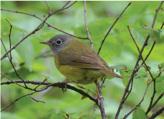
Figure 9. Connecticut Warbler ( Oporonis agilis) observed at Ellsworth in Ellsworth County, Kansas, on 11 May 2019.