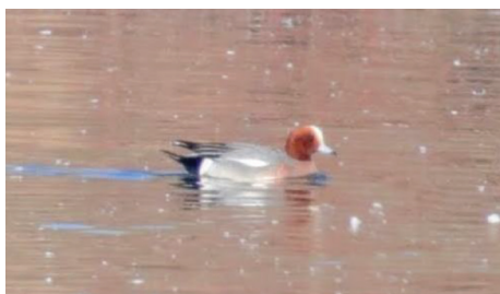
Figure 1. Eurasian Wigeon ( Mareca penelope ) observed at a sandpit in Kearny County, Kansas, on 8 March 2019.

Eurasian Wigeon ( Mareca penelope ), 2019-06, one adult male, 8 March 2019, sandpit along Road T, Kearny County, reported by David Tønnessen. Documented with photographs. Tenth state record, first with documentation and will be removed from the hypothetical list.