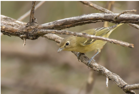
Figure 6. Cassin's Vireo ( Vireo cassinii ) observed at Hamilton State Fishing Lake in Hamilton County, Kansas, on 30 August 2020.

Cassin's Vireo ( Vireo cassinii ), 2019-21, one immature, 30 August 2019, Hamilton State Fishing Lake, Hamilton County, reported by Malcolm Gold. Documented with photographs.