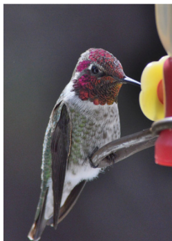
Figure 2. Anna's Hummingbird ( Calypte anna) observed southwest of Wilson in Russell County, Kansas, on 11 October 2019.