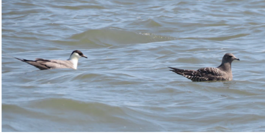
Figure 3. Long-tailed Jaegers ( Stercorarius longicaudus ), adult on left, juvenile on right, observed at El Dorado State Lake in Butler County, Kansas, on 7 September 2019.

Long-tailed Jaeger ( Stercorarius longicaudus ), 2019-22, one adult and one immature, 5 September 2019 to 7 September 2019, El Dorado Reservoir, Butler County, reported by Tom Ewert, Curt VanBoening, and Dee Dunlap. Documented with photographs. Eighth state record.