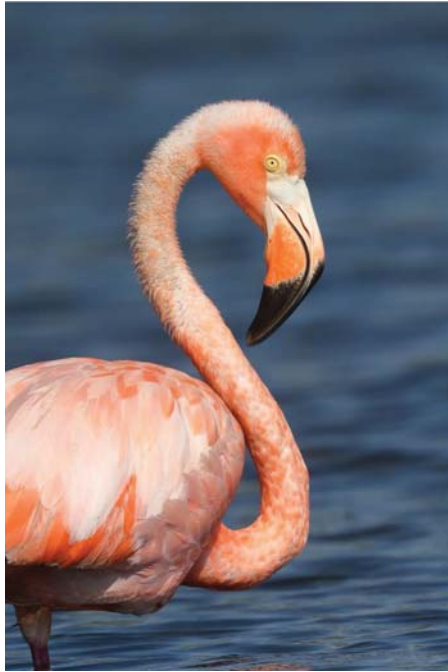
Figure 5. American Flamingo ( Phoenicopterus ruber ) observed on 27 September 2023 at Chase State Fishing Lake, Chase County.

Common Ground-Dove ( Columbina passerina ), 2023-42, unknown age, 24 November 2023, in a rural area south of Colony, Allen County, by Jayden Bowen, also seen by Andrew Burnett. Documented with photographs (Figure 6).