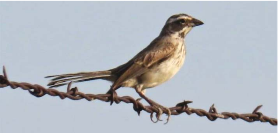
Figure 11. Black-throated Sparrow ( Amphispiza bilineata ) observed on 23 August 2023 at a playa south of Grinnell, Gove County.

Black-throated Sparrow ( Amphispiza bilineata ), 2023-22, immature, 23 August 2023, at a playa south of Grinnell, Gove County, by Christopher Frick. Documented with photographs (Figure 11). Thirteenth state record.