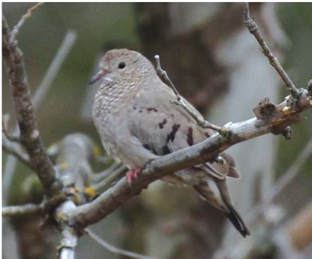
Figure 6. Common Ground-Dove ( Columbina passerina ) observed on 24 November 2023 in Allen County.

Common Ground-Dove ( Columbina passerina ), 2023-42, unknown age, 24 November 2023, in a rural area south of Colony, Allen County, by Jayden Bowen, also seen by Andrew Burnett. Documented with photographs (Figure 6).