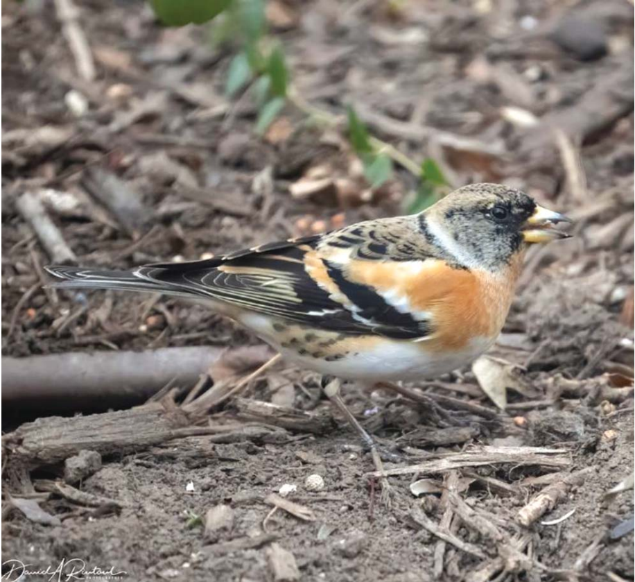
Figure 9. Brambling ( Fringilla montifringilla ) observed on 21 March 2023 in Abilene, Dickinson County.

Brambling ( Fringilla montifringilla ), 2023-02, adult male, 16 - 23 March 2023, in a residential yard, Abilene, Dickinson County, by Brenda and Tim Holm, and many other observers. Documented with photographs (Figure 9). Second state record.