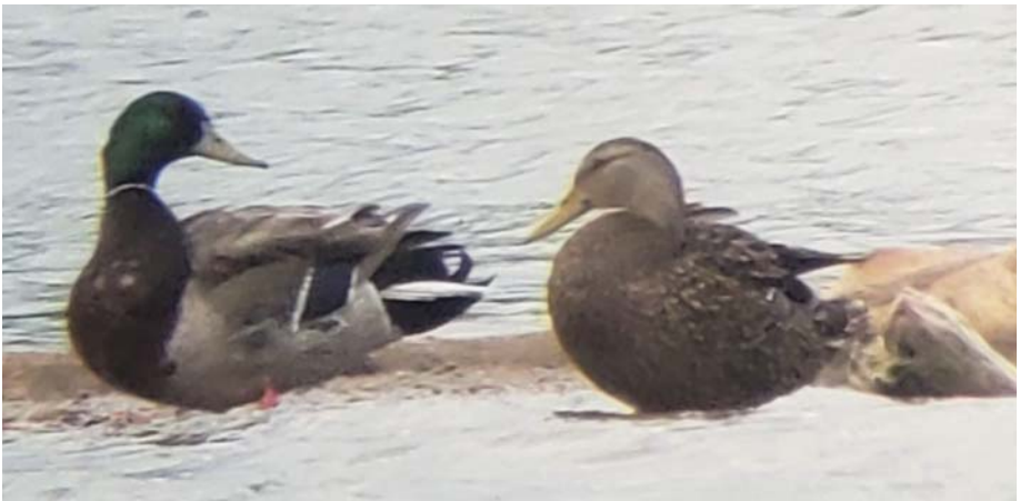
Figure 2. Mexican Duck ( Anas diazi) on the right, with a Mallard ( Anas platyrhynchos) on left, observed on 11 May 2023, Sam's Pond south of Syracuse, Hamilton County. Notice the bill color, and contrast between neck and underside of the Mexican Duck.