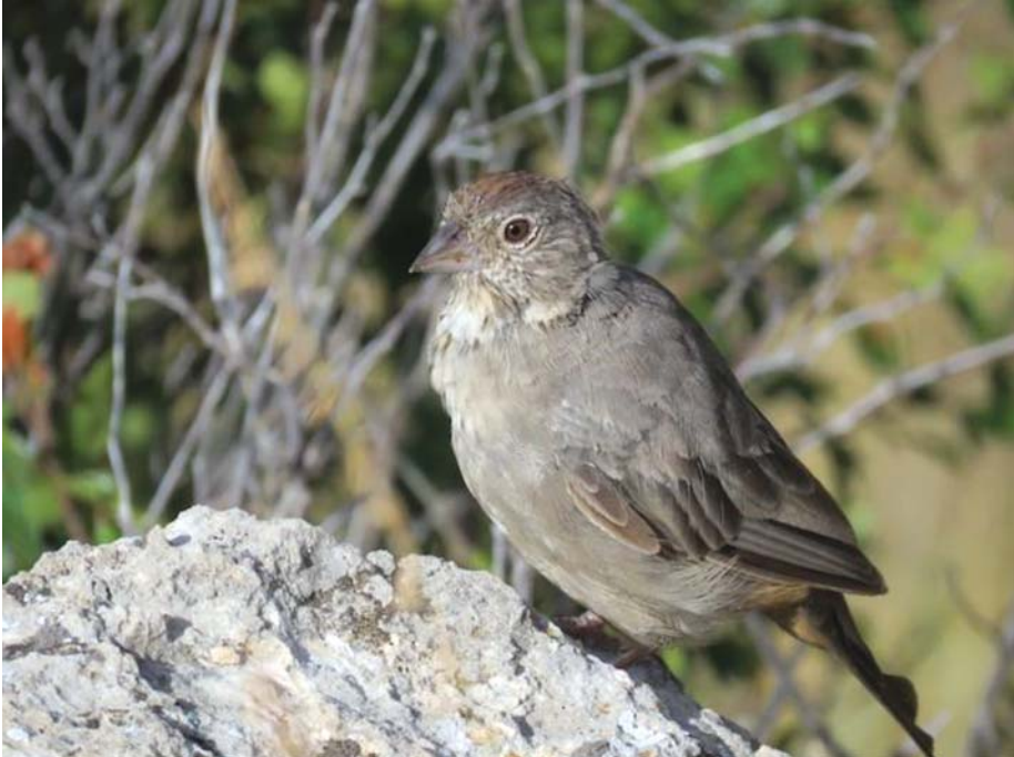
Figure 12. Canyon Towhee ( Melospiza fusca ) observed on 16 September 2023 at Point of Rocks, Cimarron National Grassland, Morton County.

Canyon Towhee ( Melospiza fusca ), 2023-31, unknown age, 16 September 2023, at Point of Rocks, Cimarron National Grassland, Morton County, by Joseph Miller, also seen by Andrew Miller, Anthony Miller and Franklin Miller. Documented with photographs (Figure 12). Seventh state record.