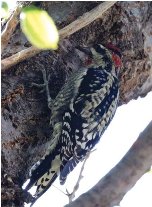
Figure 7. Red-naped Sapsucker ( Sphyrapicus nuchalis ) observed on 10 October 2022, Garden City, Finney County.

Red-naped Sapsucker ( Sphyrapicus nuchalis ), 2023-01, adult, 7 - 12 October 2022, in Garden City, Finney County, by Sara Shane and Tom Shane. Documented with photographs (Figure 6). Eleventh accepted record.