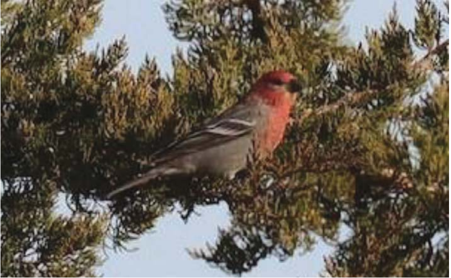
Figure 10. Pine Grosbeak, ( Pinicola enucleator ) observed on 15 November 2023, Scott State Park, Scott County.

Black-throated Sparrow ( Amphispiza bilineata ), 2023-17, immature, 4 September 2023, at Point of Rocks, Cimarron National Grassland, Morton County, by Franklin Miller also seen by Dwight Miller. Documented with photographs. Twelfth state record.