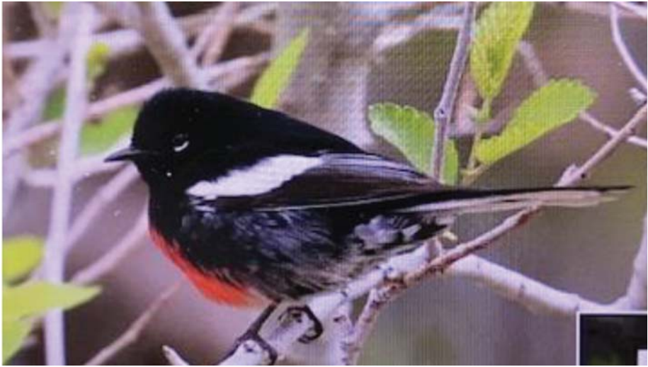
Figure 13. Painted Redstart ( Myioborus pictus ) observed on 28 April 2023 at Elkhart, Morton County.