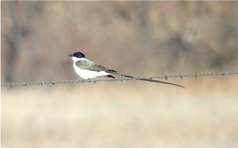
Figure 8. Fork-tailed Flycatcher ( Tyrannus sayana ) observed on 9 November 2023 in Reno County.

Fork-tailed Flycatcher ( Tyrannus savana ), 2023-35, adult, 9 - 10 November 2023, along a rural road south of Langdon, Reno County, by Steve Seibel, also seen by Mike Rader and Bryan White and several other observers. Documented with photographs (Figure 8). Second state record and the first verified with physical evidence. Hypothetical status removed.