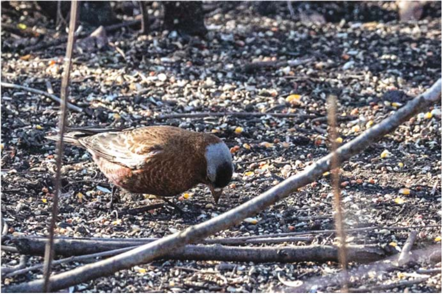
Figure 8. Gray-crowned Rosy-Finch ( Leucosticte tephrocotis ), KBRC #2024-07, observed 11 March 2024 in Chisholm Creek Park, Wichita, Sedgwick County.

Gray-crowned Rosy-Finch , ( Leucosticte tephrocotis ), 2024-07, adult, 11 March 2024, at a bird feeding station in Chisholm Creek Park, Wichita, Sedgwick County by Phyllis Richert. Documented with photographs (Figure 8). Second state record and the first verified with physical evidence. Hypothetical status removed.