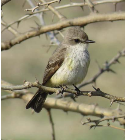
Figure 5. Adult female Vermilion Flycatcher ( Pyrocephalus rubinus ), KBRC #2024-08, observed 13 March 2024 at a rural farmstead near Nickerson, Reno County.

Vermilion Flycatcher , ( Pyrocephalus rubinus ), 2024-08, adult female, 13 March 2024, at a rural farmstead near Nickerson, Reno County, by Joseph Miller, also seen by Franklin Miller and Anthony Miller. Documented with photographs (Figure 5).