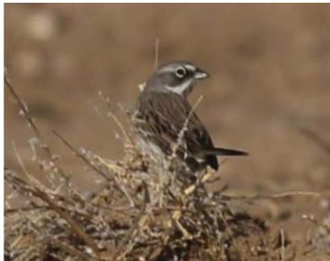
Figure 9. Sagebrush Sparrow ( Artemisiospiza nevadensis ), KBRC #2024-06, observed 6 March 2024 at Cimarron National Grasslands, Morton County.

Sagebrush Sparrow , ( Artemisiospiza nevadensis ), 2024-06, adult, 6 March 2024, Cimarron National Grasslands, Morton County, by Franklin Miller. Documented with photographs (Figure 9). This is the fourth state record, the first confirmed sighting since 1974.