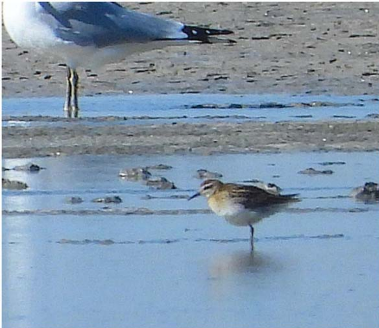
Figure 3. Immature Sharp-tailed Sandpiper ( Calidris acuminata ), KBRC #2024-23, observed 1 November 2024 at Quivira National Wildlife Refuge, Stafford County.

Pomarine Jaeger , ( Stercorarius pomarinus ), 2024-05, unknown age, 4-5 November 2023, Tuttle Creek Cove Park area of Tuttle Creek Lake, Riley County, by Logan