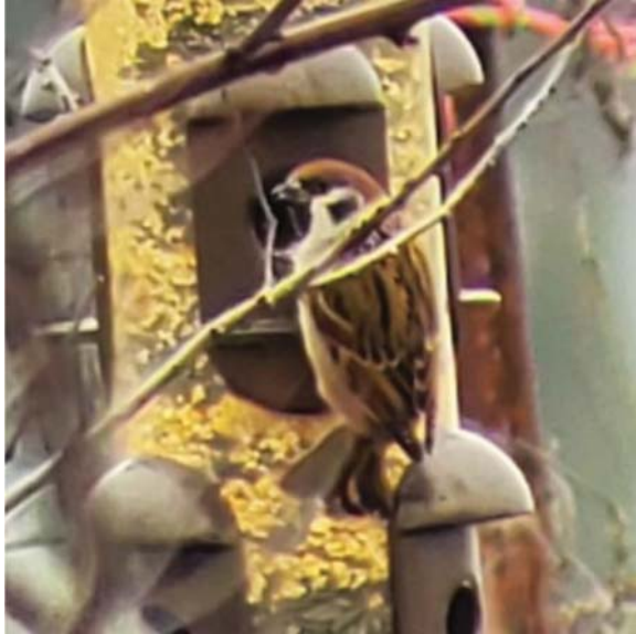
Figure 6. Adult male Eurasian Tree Sparrow ( Passer montanus ), KBRC #2024-04, observed 23 November 2023 to mid-August 2024 near Topeka, Shawnee County.

Eurasian Tree Sparrow , ( Passer montanus ), 2024-04, adult male, 23 November 2023 to mid-August 2024, in a residential yard north of Topeka, Shawnee County, by Dallas Alexander and seen by many other observers. Documented with photographs (Figure 6). This bird mated with a female House Sparrow ( Passer domesticus ) and hybrid young were observed. This is the first record of this species in Kansas and will be added to the KOS Check-list.