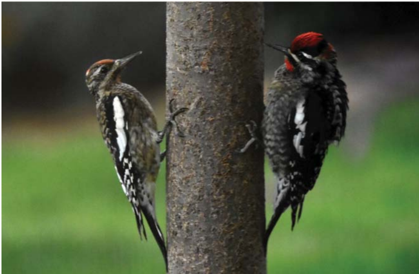
Figure 4. Immature (left) and adult (right) Red-naped Sapsuckers ( Sphyrapicus nuchalis ), KBRC 2024-15, observed 10 October 2024 in Dodge City, Ford County.

Red-naped Sapsucker , ( Sphyrapicus nuchalis ), 2024-15, one immature and one adult, 10 October 2024, in a residential yard in Dodge City, Ford County, by Christi McMillen. Documented with photographs (Figure 4). Twelfth accepted record.