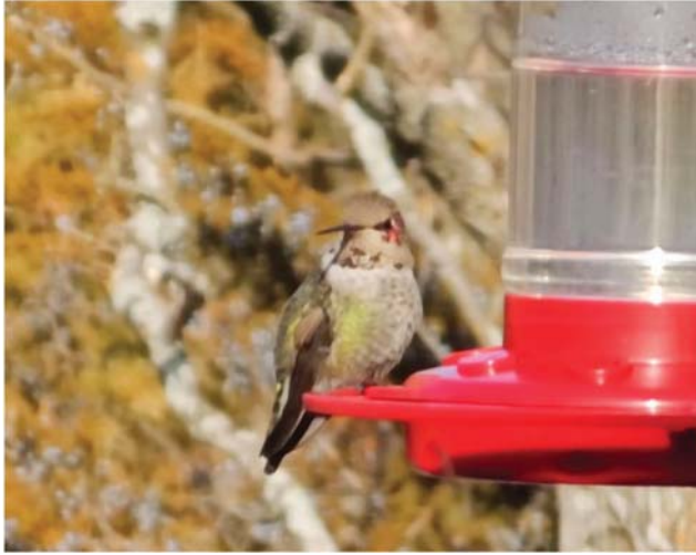
Figure 2. Second year male Anna's Hummingbird ( Calypte anna ), KBRC #2024-01, observed November 2023 to 13 January 2024 in Oskaloosa, Jefferson County.