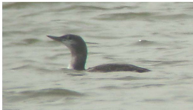
Red-throated Loon photographed November 29, 2002 at Winfield City Lake.

Remember KOS.... If you would like to help the Kansas Ornithological Society's future growth consider leaving a memorial trust for the Society or including the KOS in your will. If you would like more information feel free to contact any of the Board Members.