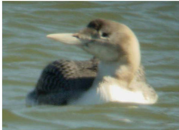
Yellow-billed Loon photographed November 16, 2002 at Clark State Fishing Lake.