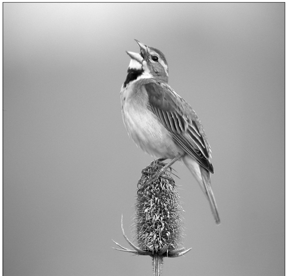
Above: Dickcissel at the KCPL Gardner Wetlands.